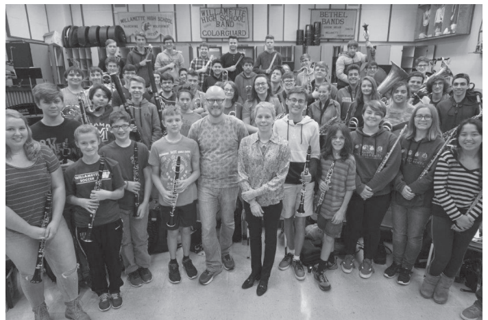
Augusta Read Thomas visits Willamette High School band students.

Augusta Read Thomas's impact in our region extends far beyond the concert hall, inspiring future generations of musicians and providing insights into the life as a professional composer. Through this Artist Residency, we are able to connect more people with the Eugene Symphony and build lasting connections that will extend beyond Gusty's time in town. We cannot wait for her return in April! We hope you will join us for some of the incredible activities we have planned. Stay up to date by visiting our website eugenesymphony.org 🎻